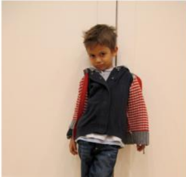
Planet Awesome Kid