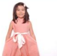
The Journals of Giddy Giddy