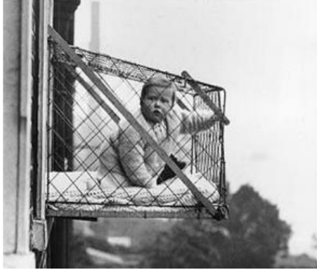
Vintage for Kids