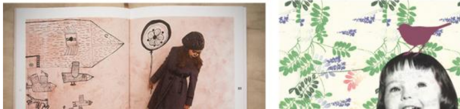
Kickcan & Conkers

Kickcan & Conkers kids, modern vintage living & sunshine galore