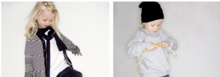
Little Fashion Blog

BLOG EPHEMERE IDEAS INSPIRATION SPIRIT CREATION LABORATOIRE CONTRIBUTORS