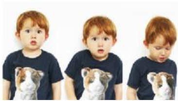
The Brothers Trimm

All too often, boys' fashion is overlooked and under-represented, but The Brothers Trimm is a blog that prides itself on featuring products and clothing exclusively with boys in mind. The content is nicely balanced - without the usual focus on stereotyped boys' interests, such as football and cars - and looks back at classic products while offering up-to-date interpretations. The Brothers Trimm also offers entertaining make-and-do projects and new boys' apparel.